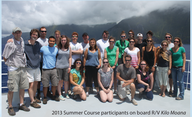
2013 Summer Course participants on board R/V Kilo Moana

A laboratory-field training course at the University of Hawai'i at Mānoa